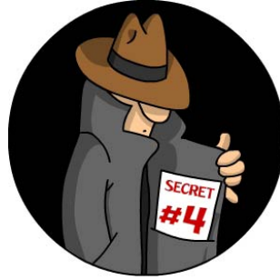
Resume Secret #4